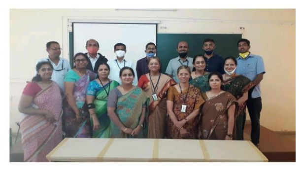
Faculty members of Dept. who witnessed the online Technical paper presentation PAPYRUS-2020

The best paper was selected from each venue and awarded with a cash prize of Rs.1000 and certificate.