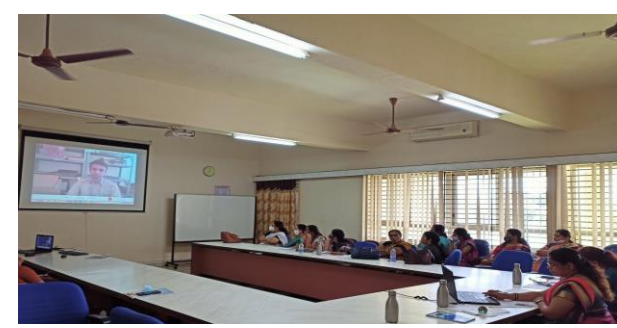
Virtual Alumni Meet